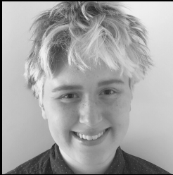
ES SYBOM WAITING FOR DAISY