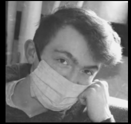
ELIJAH SMART THE RULE OF LAW